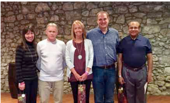
The new members were recognized at Mon Ami.