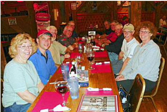
Dinner at KC barbeque. The best part of a DE is enjoying time with other participants.