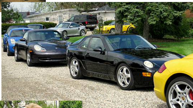
Cars lined up in the driveway of R and A Engineering.