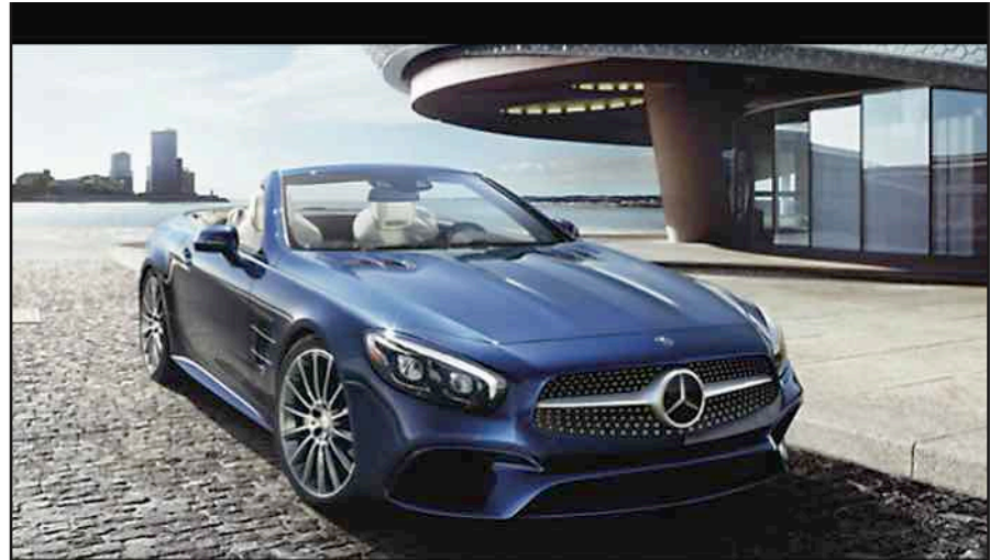
2017 Mercedes-Benz SL Roadster Reimagined. Restyled. Breathtaking.