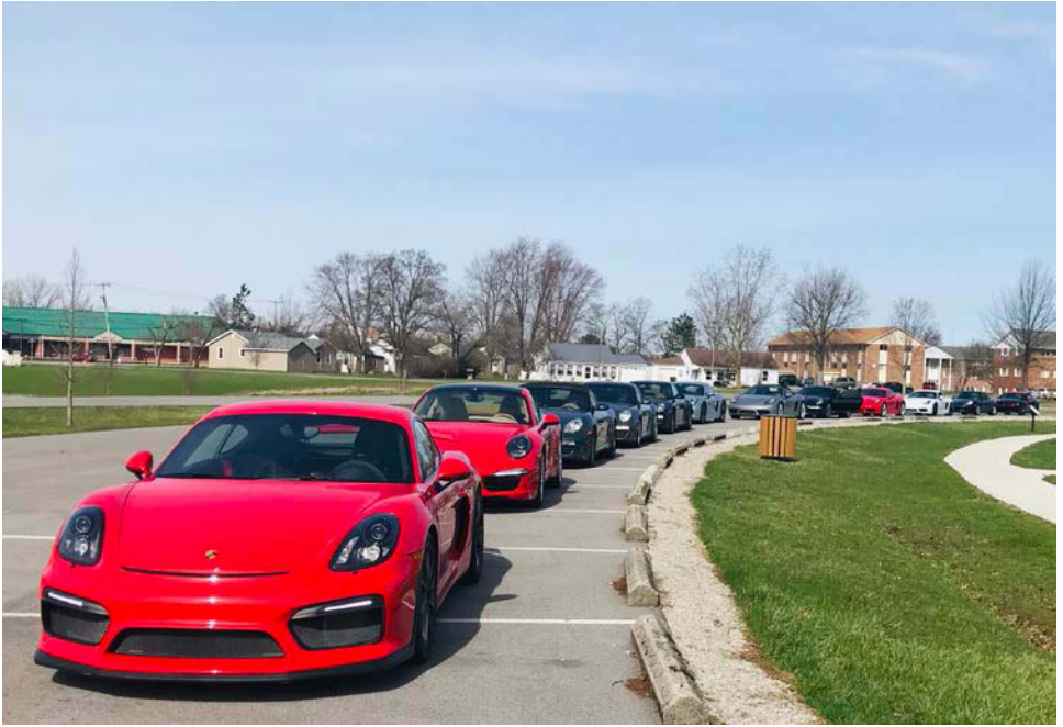
MVR members on the way to Auburn