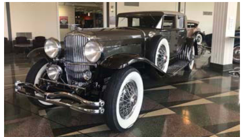
MVR, Michiana, and SEM members on the docent led tour at the Auburn Duesenberg Cord Museum