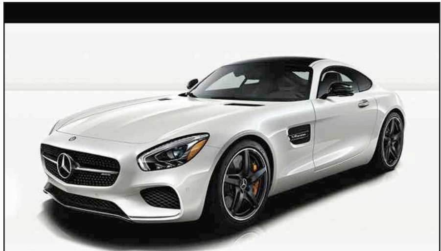
2017 Mercedes-Benz AMG GT The shape of performance. Take a test drive today.