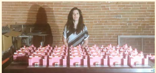
Overseeing production of Porsche Parade Trophies 7