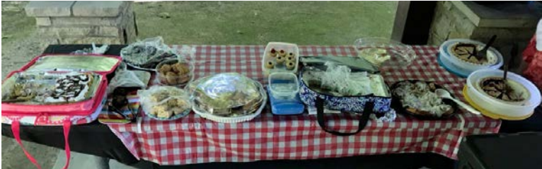
A table full of wonderful desserts.