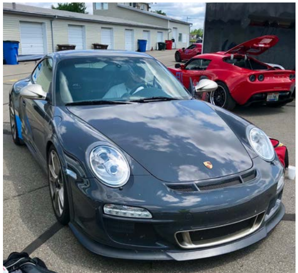
A 997.2 GT3 RS waiting to attack the track. Grattan 2018 Photo: Joe Sheamer | Camera: iPhone 7 Plus.

Präzision in allen Dingen derrückspiegel@gmail.com