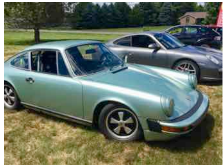
A few of the cars on the lawn