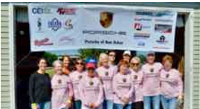
Photo on cover: The track Divas