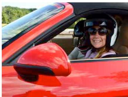
The Divas were all smiles when their runs finished.